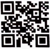
Table of Renewal